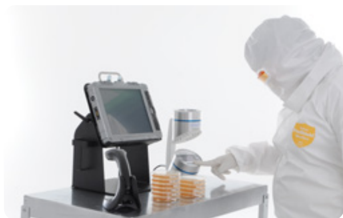
MAS-100 NT ® air samplers manufactured by MBV AG, Switzerland. www.mbv.ch